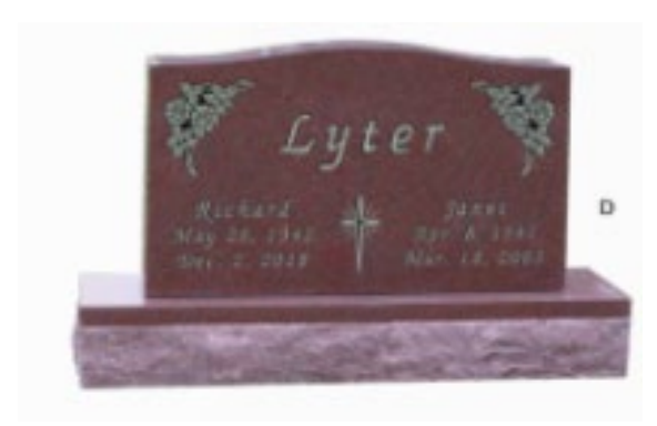
Sample of Double 2-piece Upright Monument

DOUBLE UPRIGHT MONUMENTS (see measurements below) are intended to be used for 2 internments and will be centered in the middle of the 2 Grave Lot.