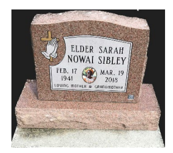
Sample of larger 2-piece Single Upright Monument

SINGLE UPRIGHT MONUMENTS (see measurements below) will be centered in the middle of the 2 Grave Lot. If the second grave is eventually used for future burial, the single upright monument will have to be replaced with a double monument or the second internment's grave can be marked with a lawn level flat marker. One upright monument per 2 grave lot.